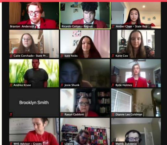
Region 4 Spring Meeting