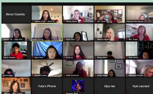
Region 5 Spring Meeting

"For those who are planning to run for Region, it's such a great experience! As president, I'm grateful for my team and glad that the meeting went fantastic. The preparation was a little challenging this year but I'm glad my team and I pulled through just to make sure Region 8 is great!"