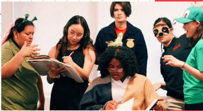
Pictured: The State Officers' "Your Story, Our Story" Skit

Region and State Officers. Workshops such as Parliamentary Procedure, STAR Events, and individual officer position training left our leaders with skills they will use for their year in office. The day ended with bowling and billiards at the Student Center and team building activities. Thursday morning