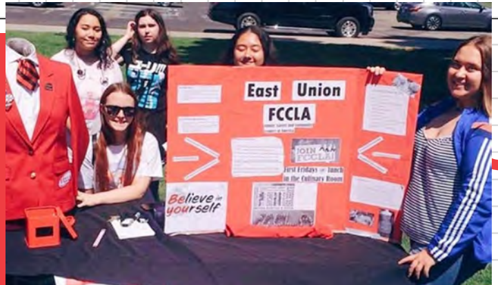
Pictured: The East Union Chapter

Our members have taken part in creating posters, speaking to their fellow classmates, and participating in their club fairs to show their schools what our organization is all about.