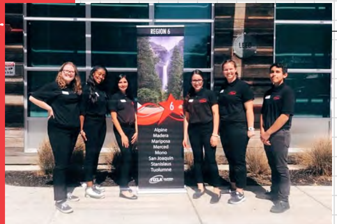
Pictured: The Region 6 Officers at their COLT

had the opportunity to learn about their officer positions and bond as a team through our Chapter Officer Leadership Training conferences hosted by our regions in August and September. The Region Officers took their skills and knowledge about leadership that they picked up at ROTC from the State Officers and passed them onto the chapter officers through officer