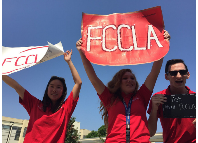
Pictured: Members from Region 5 representing their red and white pride!

We love seeing FCCLA chapters promote themselves on social media! Here are a few of our favorites from chapter accounts.