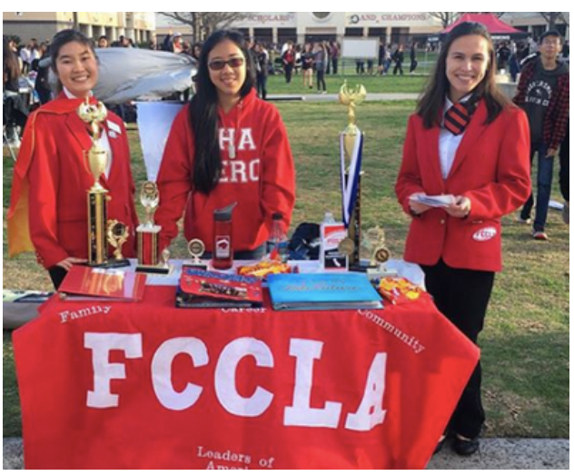
Pictured: Members from Region 10 showing off their trophies at Club Rush

Calling all Chapters! It's time to affiliate your school for FCCLA! Having a little trouble promoting this wonderful organization to your school? Here's some of our members showing off their red and white pride at their school's Club Faire!