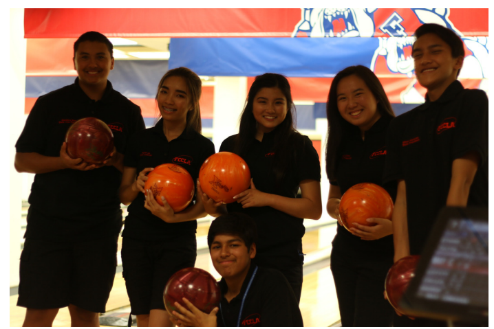
Pictured: State Officers enjoying a fun night of Bowling and Billiards

The Region Officers kicked off ROTC with the Opening General Session which consisted of ice breakers and theme presentations. Once checked in to dorms, we headed over to the Student Center for Bowling and Billiards. We then concluded the night with Team Building Activities.