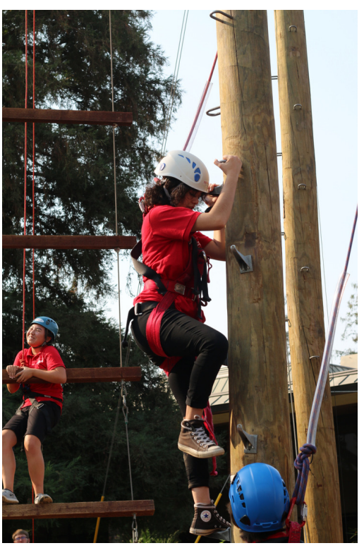
Pictured: Region 2 Officer ready to begin climbing the obstacle course

What an action packed day! The morning began with the EDGE Obstacle Course which consisted of rock climbing, bungee jumping, and team building activities. Fresno State then gave the officers a walking tour to explore the campus, which included meeting farm animals and eating some delicious ice cream! The region officers returned to general sessions for more ice breakers and workshops. Finally, they cooled down in the pool and ended the night with the movie A Wrinkle In Time .