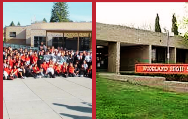
Insert Region Photos