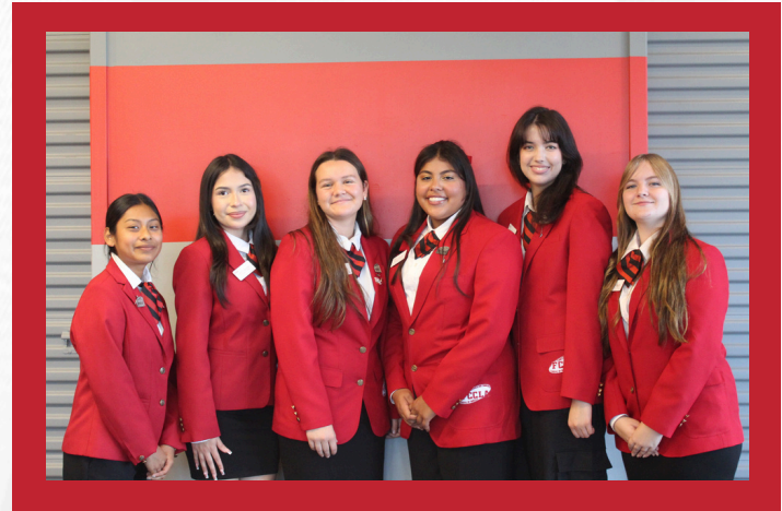
Region 7 Team!